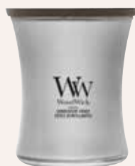
Candescent Coast Silver