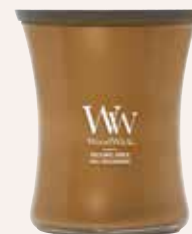
Volcanic Orris Copper