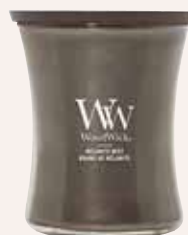
Melanite Mist Gunmetal