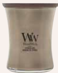
Cypress Ore Warm Nickel