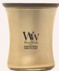
Sparkling Pomelo Champagne